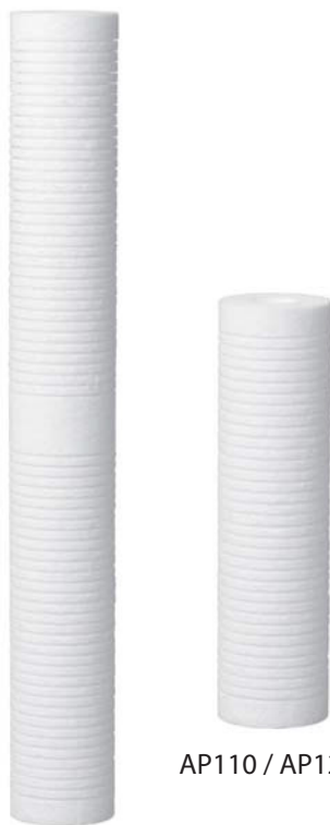
AP110 / AP124